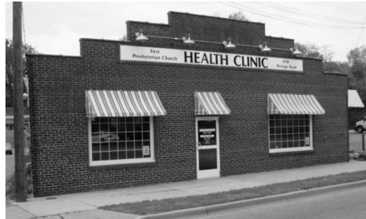
The front entrance of our new clinic, located at 2918 Portage Road in Kalamazoo

A picture is worth a thousand words, and in our case it is a thousand thank yous. A very successful Complete The Clinic Campaign enabled us to remodel a 1940s warehouse. We moved in February 2006. Thank you for the generous support of individuals and foundations that contributed. Thank you to the many volunteers who put in countless hours of labor to pack, unpack, and organize. Through the remodeling process we